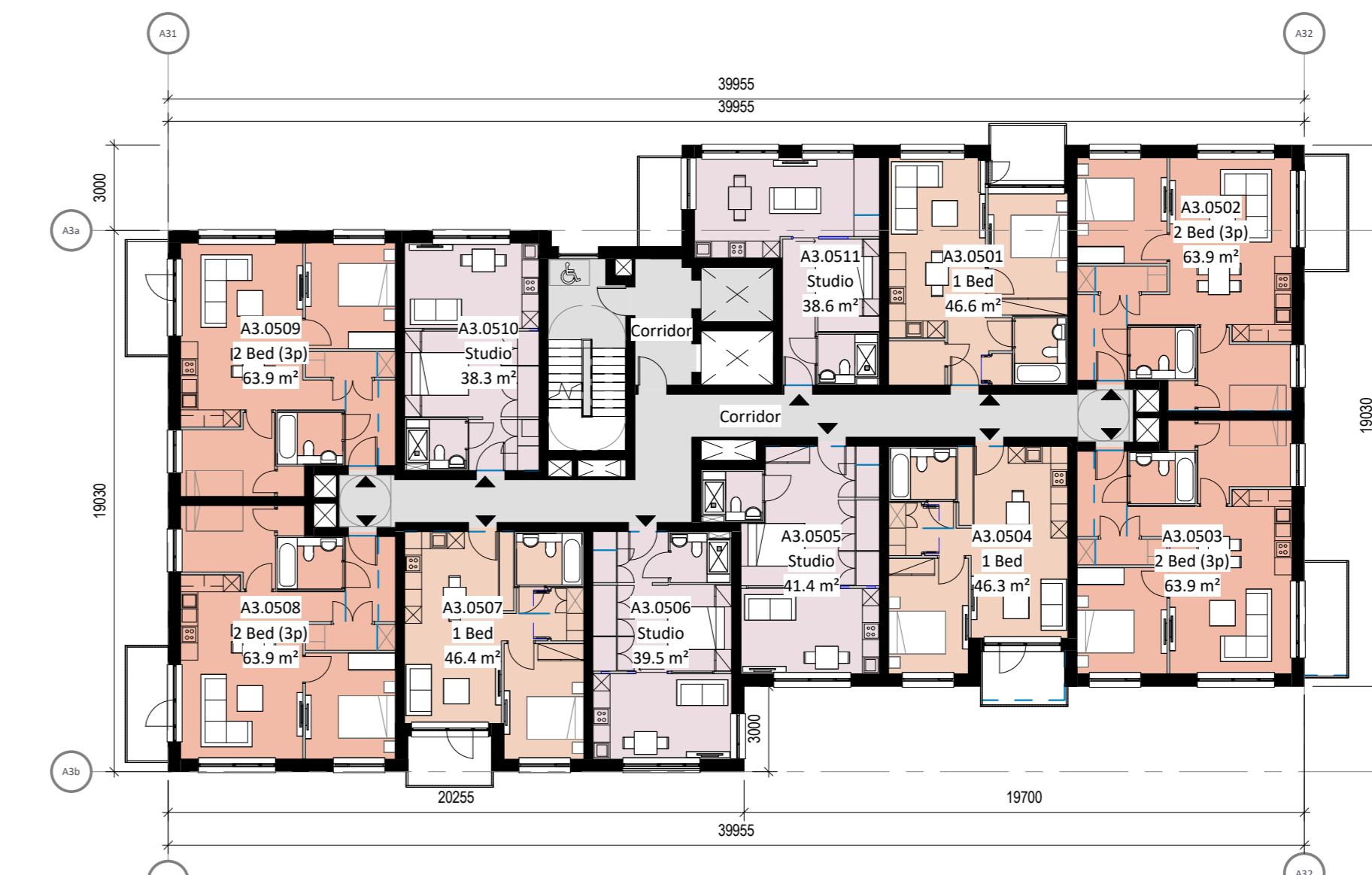
7 BLOCK A3-LEVEL 05 1:200