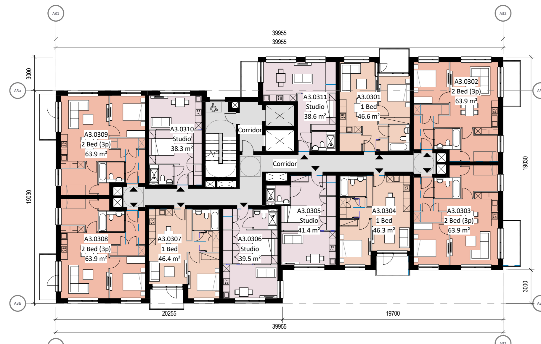
5 BLOCK A3-LEVEL 03 1:200